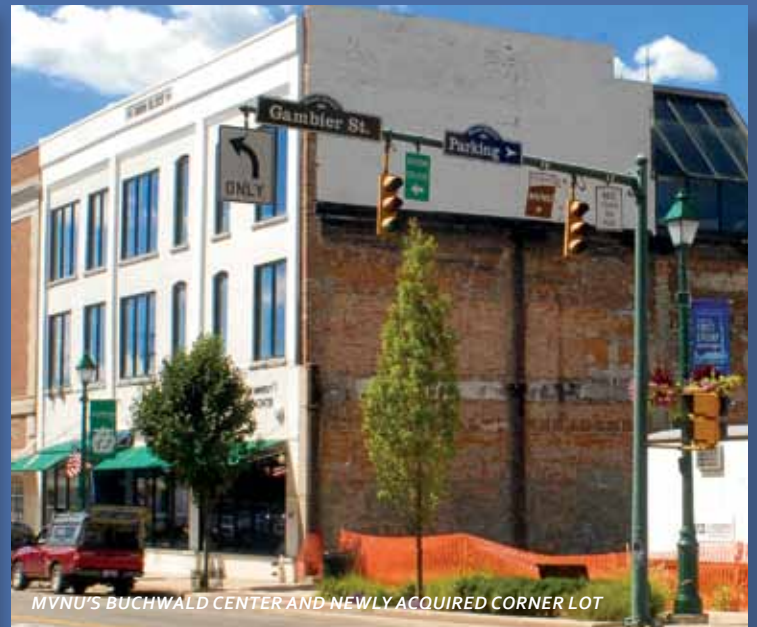
MVNU'S BUCHWALD CENTER AND NEWLY ACQUIRED CORNER LOT