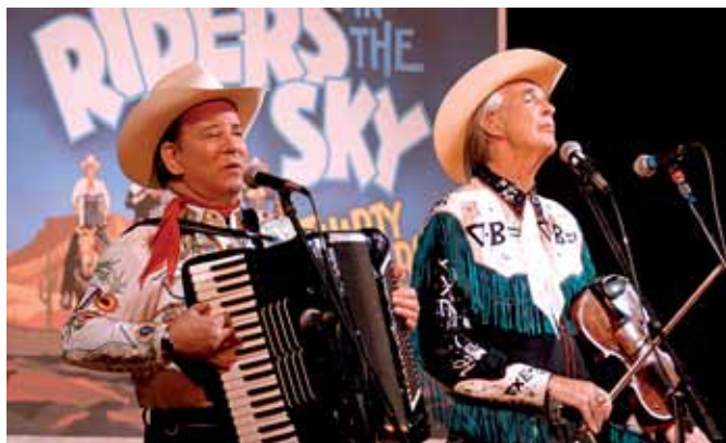
The Community Foundation sponsored a concert by the Grammy Award winning "Riders in the Sky," presented by the Community Concerts Association of Knox County, a new organization fund partner.