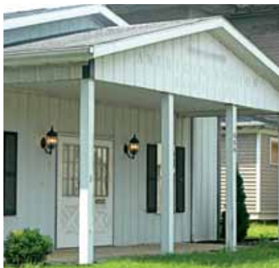
Sale of the longtime West Chestnut Street home of American Legion Post 136 enabled creation of a scholarship fund that will annually assist the child or grandchild of any active member of a Knox County veterans' organization. Post 136 members continue to meet in the Knox County Memorial Building.