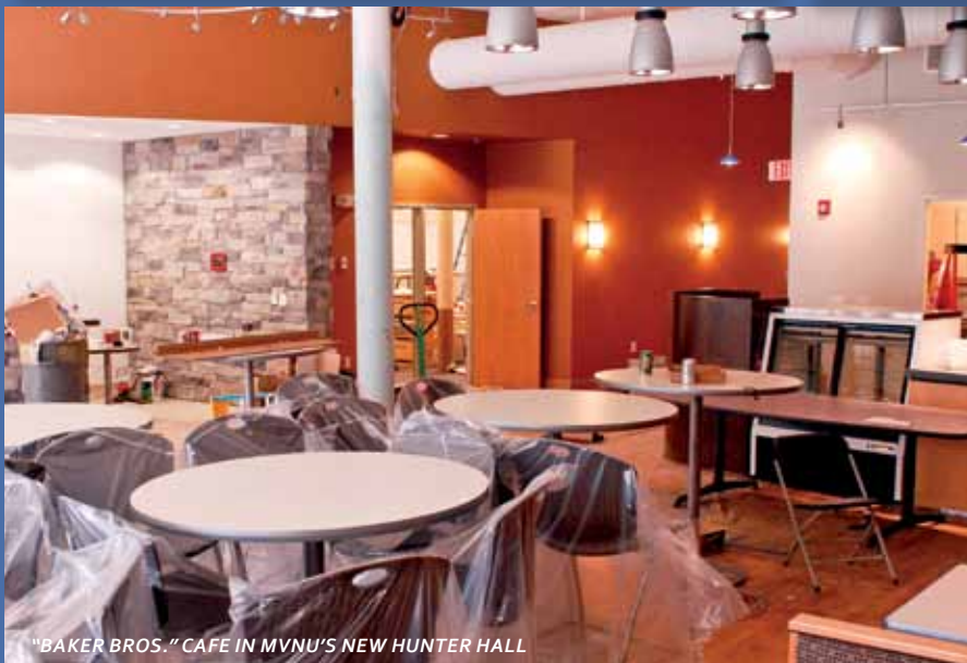
"BAKER BROS." CAFE IN MVNU'S NEW HUNTER HALL