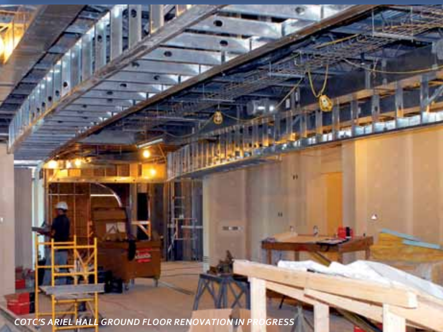
COTC'S ARIEL HALL GROUND FLOOR RENOVATION IN PROGRESS