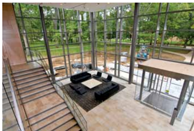
Panoramic campus vistas are enjoyed from the main lobby of the Foundation-supported Graham Gund Gallery, a 31,000 sq. ft. art history and exhibition facility at Kenyon College opening fall 2011.