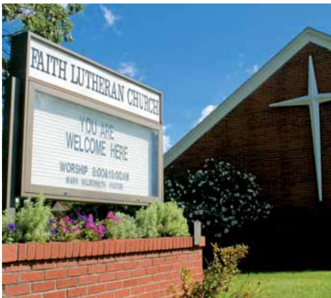
The Faith Lutheran Church Mission Fund, established in 2010 with a contribution of $122,400, will support outreach and other activities of the local congregation, while enjoying the advantages of pooled investment with similar organization funds of the Foundation.

• Collaboration with Mount Vernon-Knox County Chamber of Commerce, Knox County Area Development Corporation and Knox Community Hospital to produce promotional video, $5,000 (from the Harold C. and Roberta C. Johnson Fund)