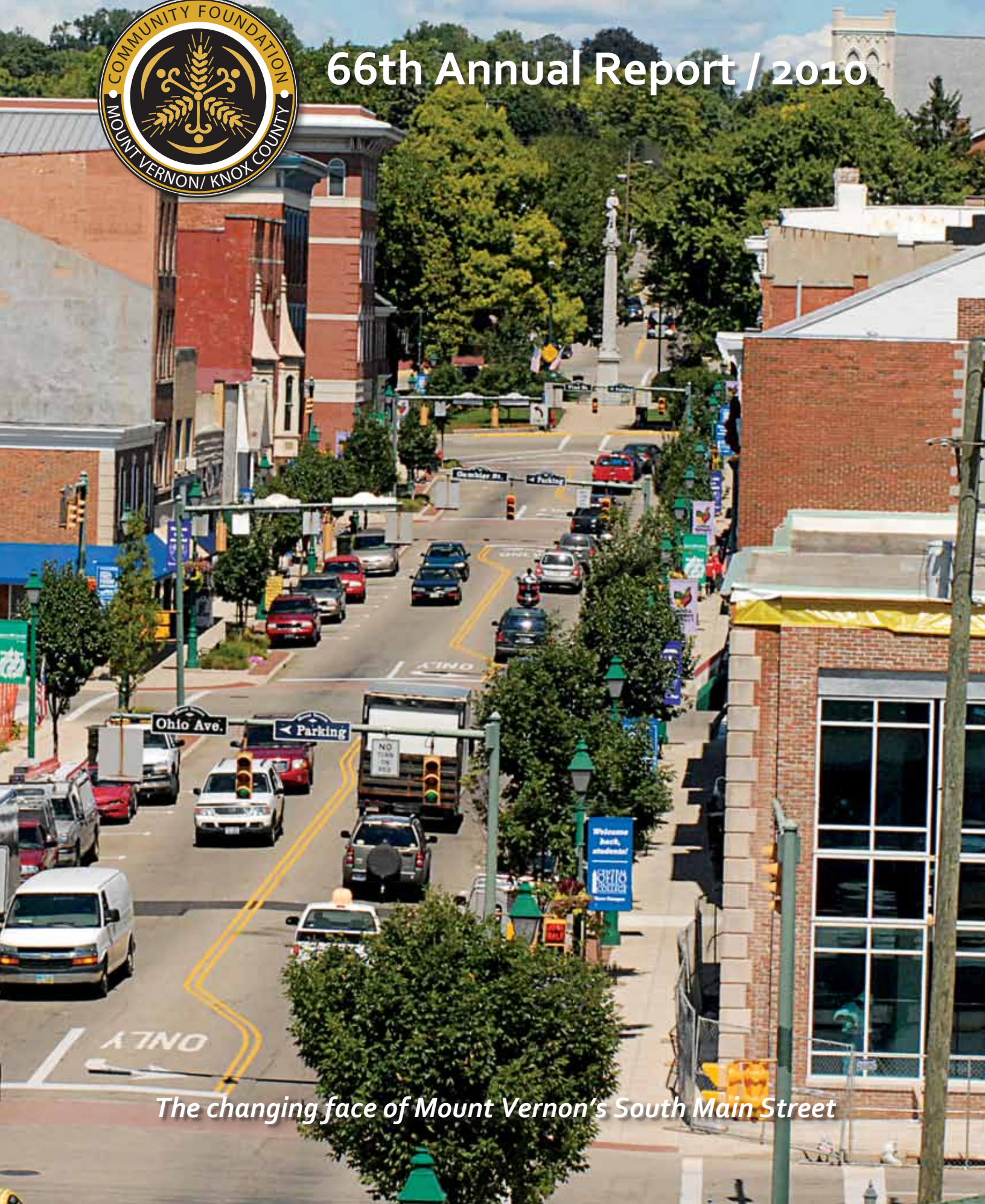
The changing face of Mount Vernon's South Main Street