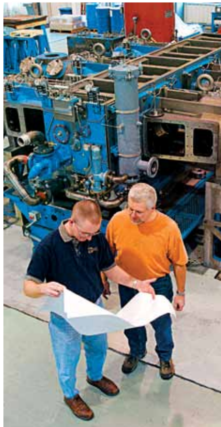
The Ariel Corporation, with its headquarters and principal manufacturing operations in Mount Vernon, funds a generous company-based scholarship program. In 2010 nearly $360,000 was awarded in varying amounts, based on scholastic performance and selection of post-secondary degree paths.