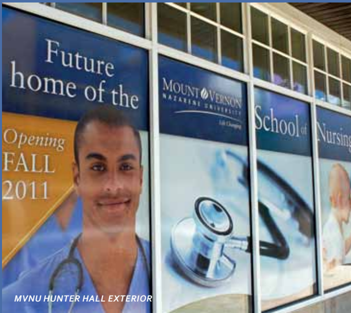
MVNU HUNTER HALL EXTERIOR