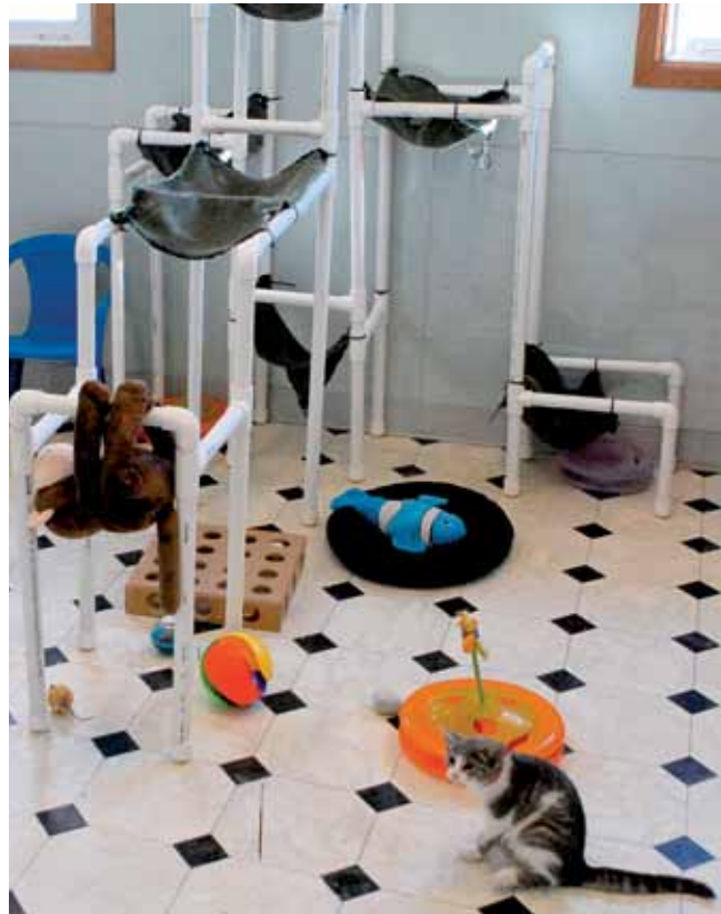
The Knox County Humane Society is the beneficiary of several Community Foundation Funds, including the Barbara S. Jones Fund, which supports operations of the recently improved KCHS Cat Shelter.

See: "Ruth T. Bemis Knox Symphony Orchestra Fund"