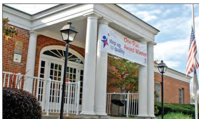
Mount Vernon YMCA North Main Street facility