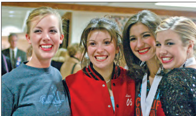
Ohio's Junior Miss Scholarship Program participants

MOUNT VERNON LIVESTOCK COOPERATIVE ASSOCIATION FUND (D) (1957)