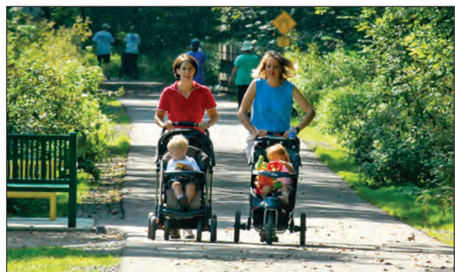
Enjoying a beautiful day on the Kokosing Gap Trail