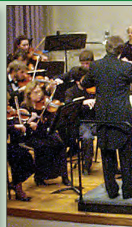
The Youth Enrichment Series (above left) provided a live performance consecutive year; the Foundation also helped replace timpani for the