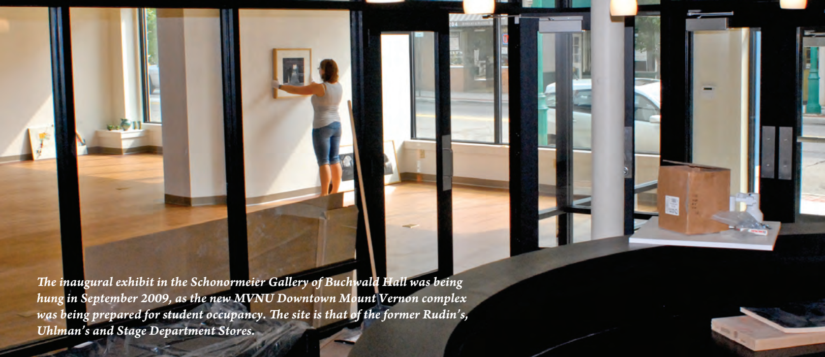
The inaugural exhibit in the Schonormeier Gallery of Buchwald Hall was being hung in September 2009, as the new MVNU Downtown Mount Vernon complex was being prepared for student occupancy. The site is that of the former Rudin's, Uhlman's and Stage Department Stores.