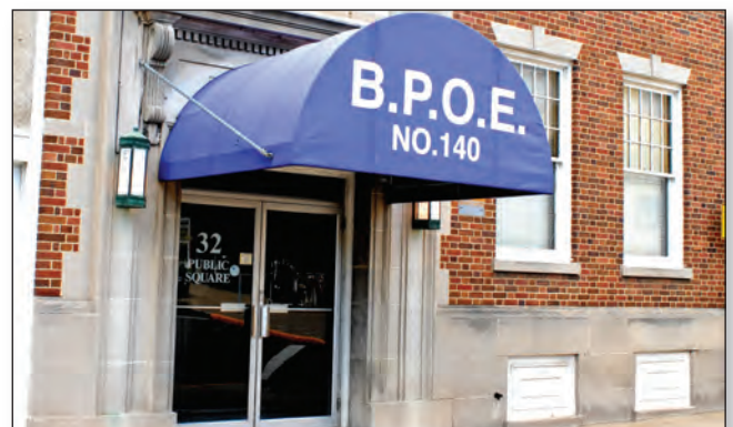
Mount Vernon Elks Lodge #140 on Public Square

See "COMMUNITY FOUNDATION MEMORIAL FUND"