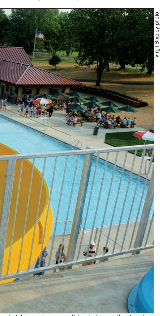
ne heights of the water slide platform following the ndation a $50,000 grant, for the city project.

Gelsanliter Family Fund (1965) Market Value : $17,505 Book Value : $14,153 Distributions : $667 Grantee : Kenyon College Scholarship Fund, $667.