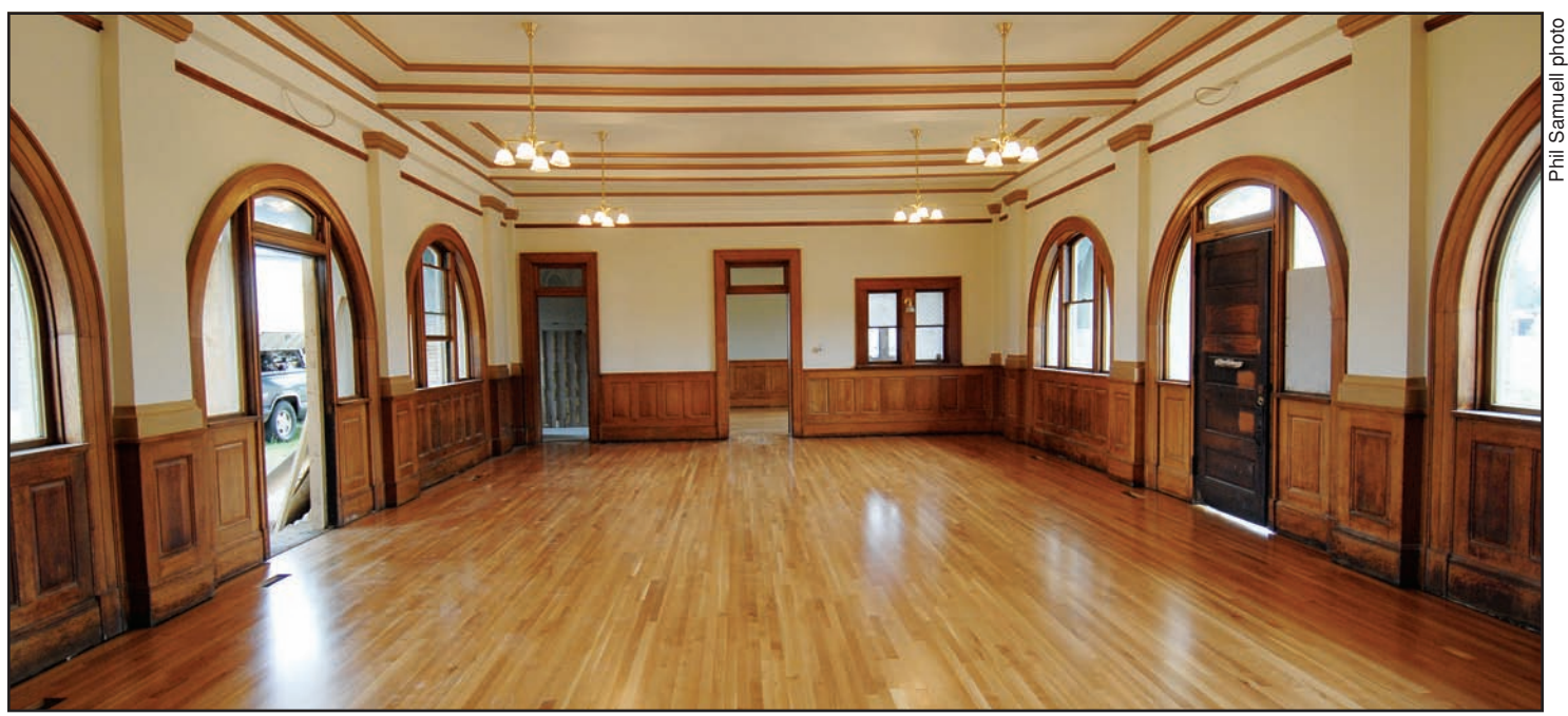
The Mount Vernon B&O Railroad Depot is shown in a latter stage of renovation. The Foundation contributed $100,000 to its rehabilitation.

Distributions: $275 Grantees: Public Library of Mount Vernon and Knox County, $275.