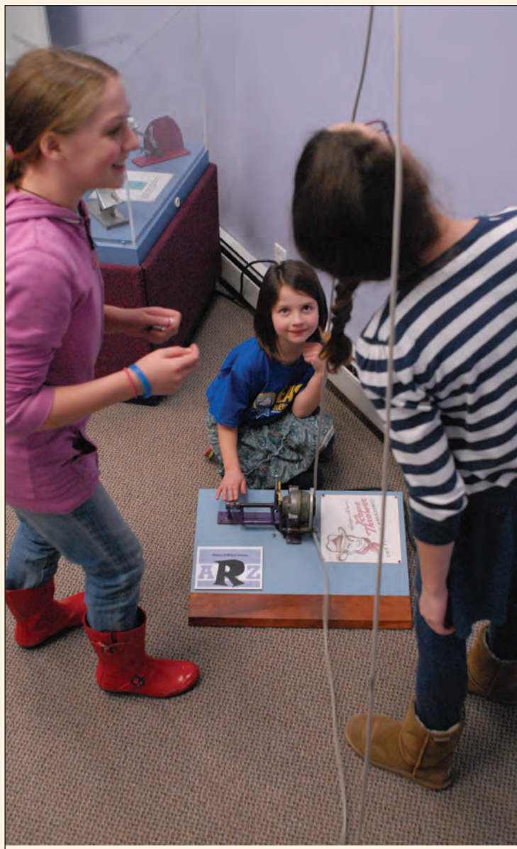
SPI Spot's "Contraptions" exhibit (above) brought guests of all ages to the C. A & C Depot over the 2014 holiday season to encounter scientific principles in an engaging context. One of the "Mount Vernon Walking Tour" signs on Public Square details the history of the Curtis Hotel which stood nearby.

The project not only allowed students to learn about the history of