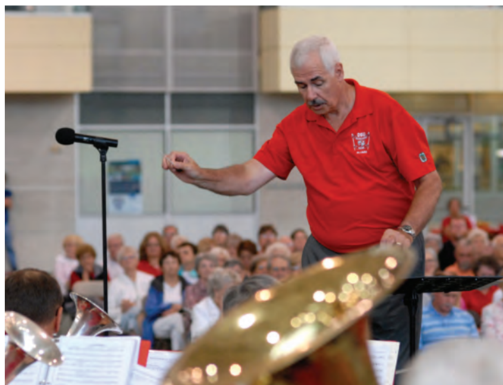
The OSU Alumni Band makes an annual concert appearance in Knox County.

nation. We have also found in the Community Foundation of Mount Vernon & Knox County a partner who is always there to help us, be it as a sponsor for the annual Buckeye Spirit Event, or by providing additional unrestricted grant funds to help stage events like our summer concerts featuring the OSU Alumni Band, or frequent appearances by the OSU Men's and Women's Glee Clubs. Though admission is free, our concerts invariably attract generous free-will donations to our scholarship fund from appreciative community members, which allowed us to begin awarding OSU scholarships to Knox County high school graduates in 2015.