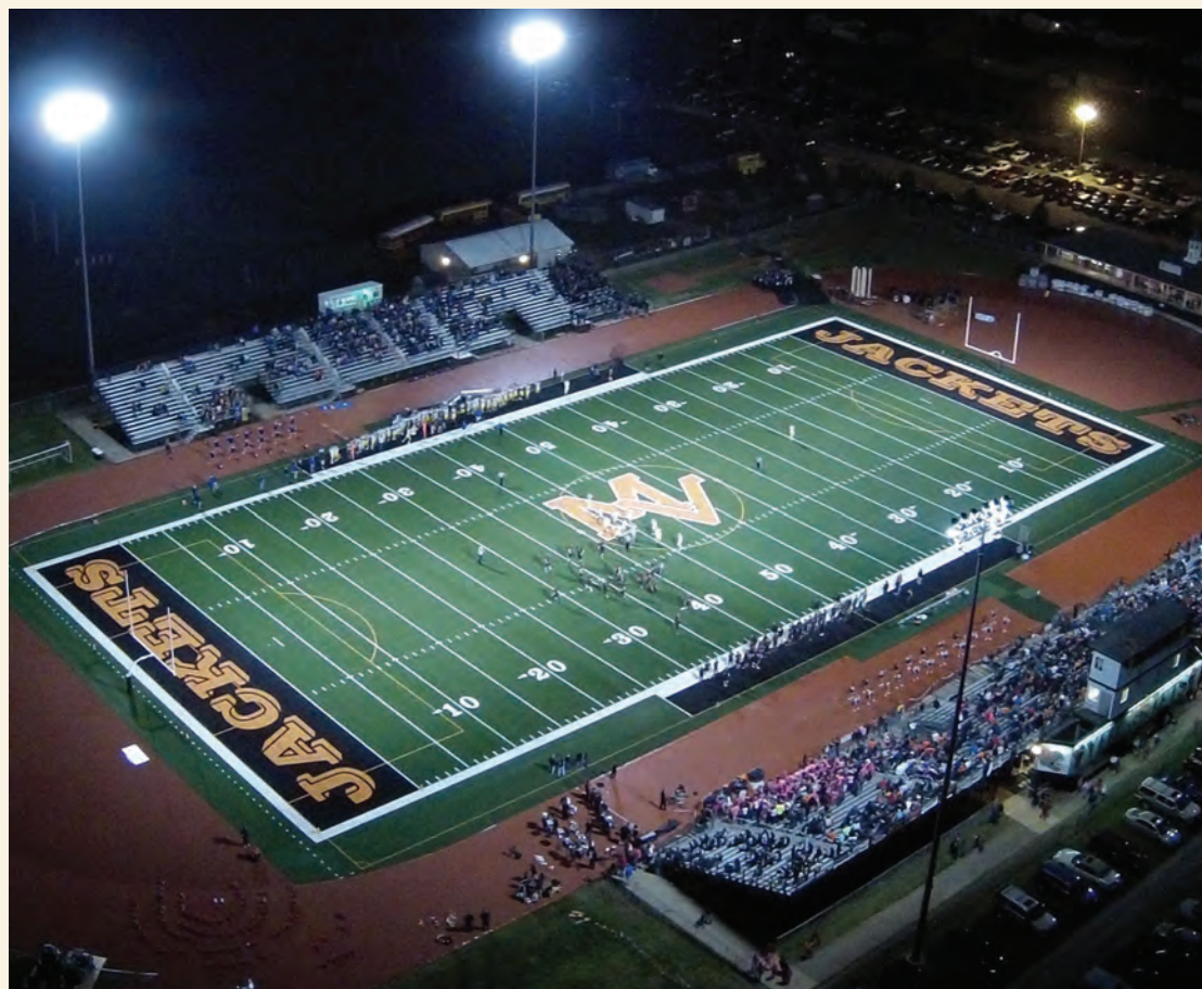
Chad Sims captured this stunning aerial photo of the new "Energy Field" in Mount Vernon's Yellow Jacket Stadium. Phase I of the rehabilitation, completed in 2014, included installation of artificial turf and a new all-weather track.

Winter shelter for Knox County's homeless men was in jeopardy when a former site used for years became unavailable. To address this urgent need Winter Sanctu-