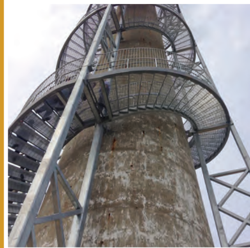
Rastin Observation Tower Ariel-Foundation Park