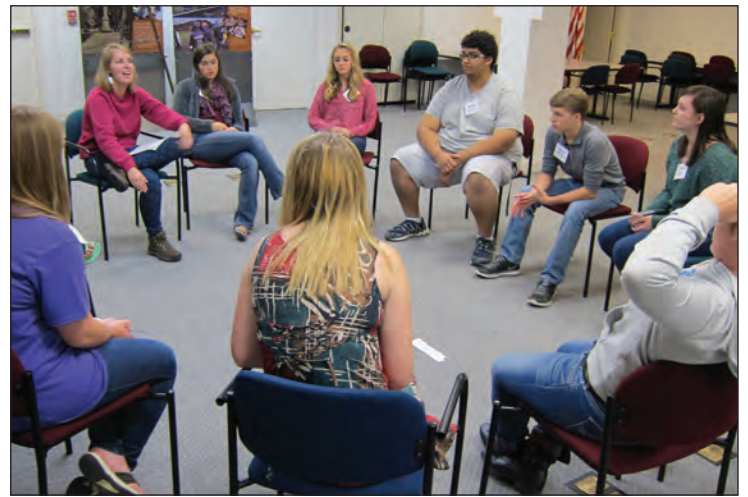
Youth Philanthropy Initiative members engage at 2014 fall training retreat.