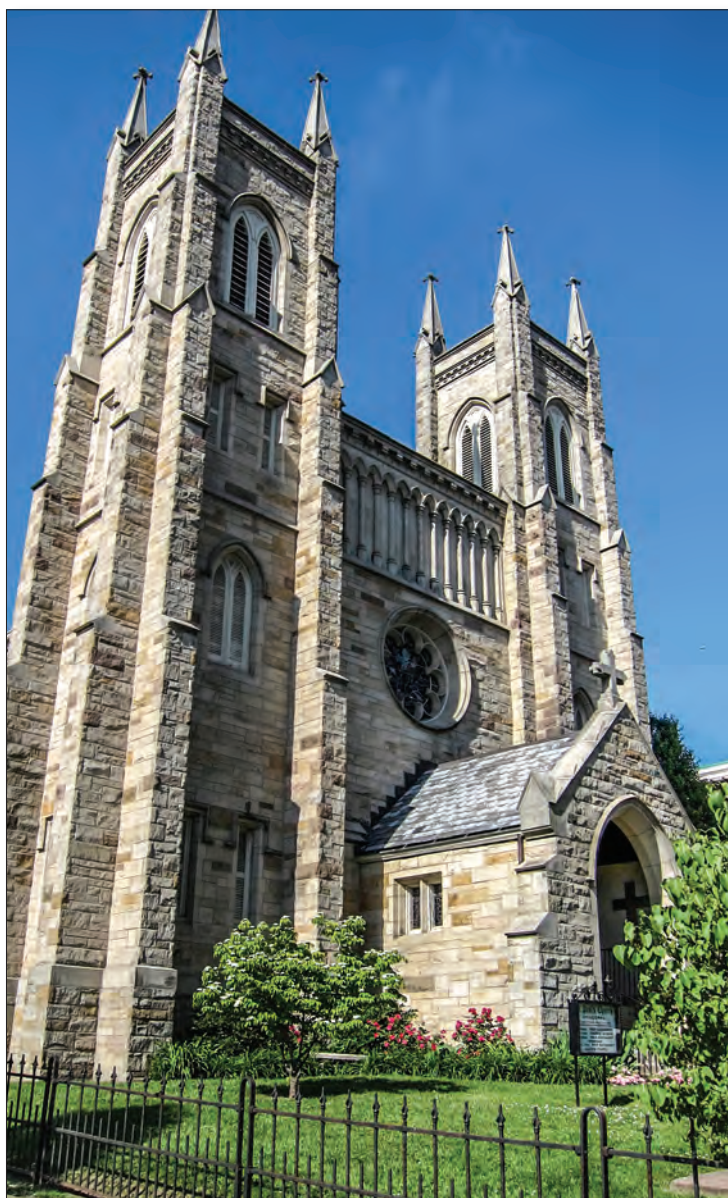
St. Paul's Episcopal Church at the corner of East High and North Gay Streets is one of many area churches that receives annual distributions from a designated fund of the Community Foundation. Creating a perpetual fund to benefit your favorite fund or charity is easily accomplished with an establishing gift of $5,000.

Sterling B. and Edna B. Braddock Fund (D-1984) MARKET VALUE: $10,638; DISTRIBUTIONS: $414; GRANTEES: Ebenezer United Methodist Church, $414.