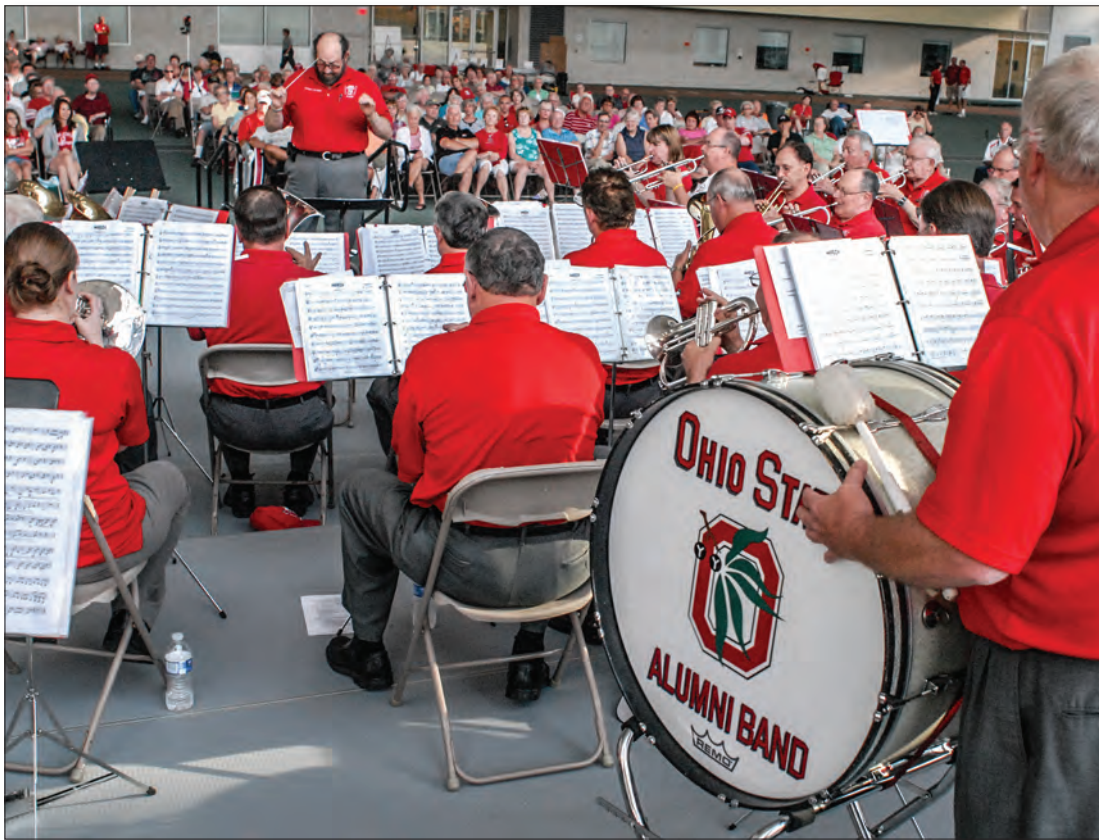
The Ohio State University Alumni Band made its first appearance in Knox County in recent decades in June 2011, playing to an appreciative audience in the Kenyon College Athletic Center (KAC). The free concert, which invited contributions to the Knox County OSU Alumni Scholarship Fund, was co-sponsored by the alumni association, the Community Foundation and the Community Concerts Association of Knox County.