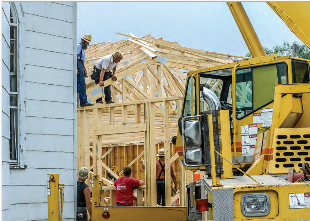
The July 23, 2011 Amish "frolic" succeeded in raising the new Sanctuary owned, Interchurch occupied, facility in just one day. Just a few feet to the left is the former home of both social service agencies.