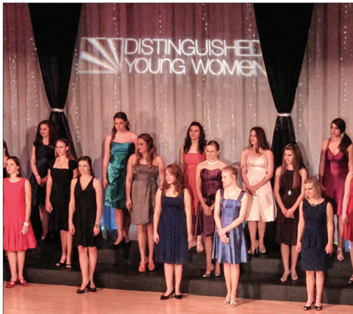
The former Ohio's Junior Miss Scholarship Program, which has long been based in Mount Vernon, was re-branded as the Distinguished Young Women program.

• Buckhaven Learning Center – Support for Knox County veterans' participation in the "Wounded Warrior" sportsman's program, $500.