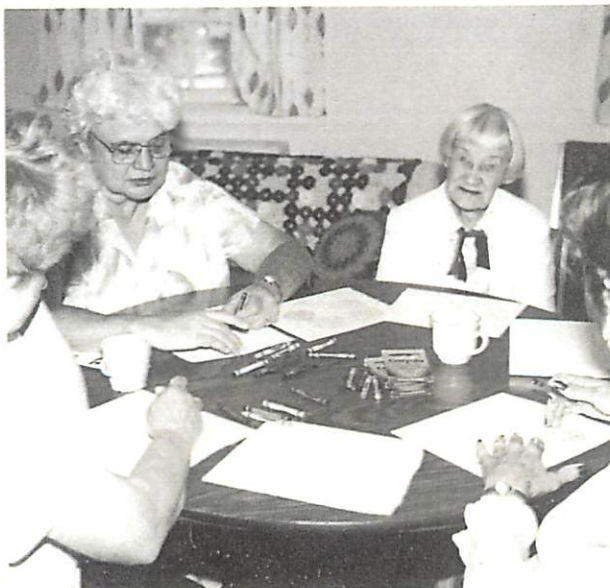
Knox County Adult Day Care Center

These funds not only benefit the community but also perpetuate the memory of the contributor, since distributions from named funds always identify the donor.