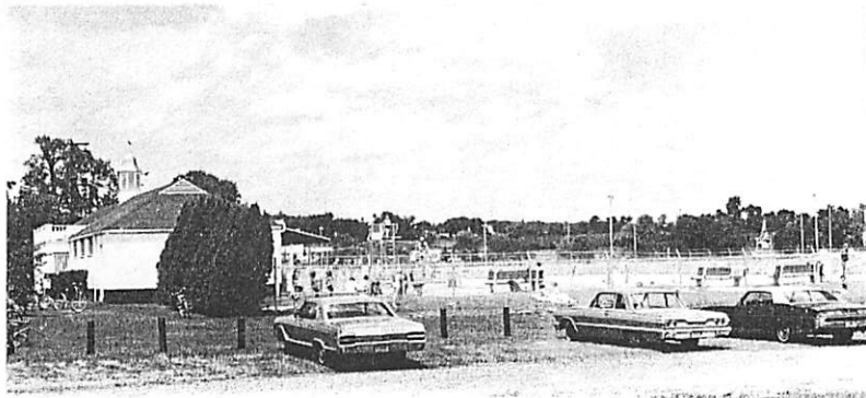
"Community Park Swimming Pool"